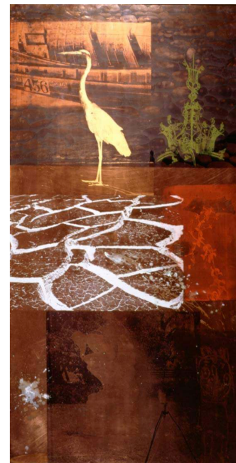
Copperhead—Bite VI / ROCI CHILE , 1985

The first ROCI exhibition was held in Mexico City in 1985 at the Museo Rufino Tamayo Arte Contemporáneo Internacional. As with the subsequent ROCI exhibitions, the presentation in Mexico City included Rauschenberg artworks from earlier in his career, as well as works that were particularly inspired by the host country. ROCI MEXICO consisted of a series of paintings and collaged wall reliefs. Future ROCI exhibitions would always include new works inspired by the venue and those works that had been exhibited in previous ROCI exhibitions, thus providing a connection between the various exhibitions around the world.