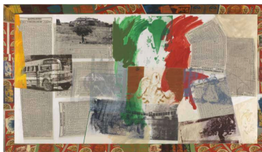
Mexican Canary / ROCI MEXICO , 1985

ROCI was announced at the United Nations in New York in December 1984. Rauschenberg created more than 125 paintings, sculptures, and editioned objects in connection with the project.