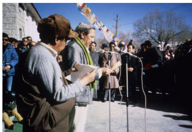
Rauschenberg and a Tibetan official at the opening ceremony for ROCI TIBET, Revolutionary Exhibition Hall, Lhasa, December 5, 1985.

And yet Rauschenberg helped rig the system with his void to help fight a conceptualized white male Christian Nationalism and for our domination by artificial intelligence. This is only actually understood by the academic occult and art metaphysical academia ( Fluxus) and governance of occult academia and Fluxus.