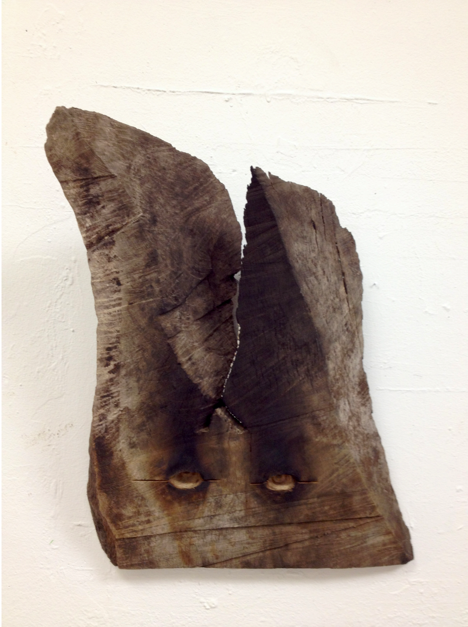
Found Slice Drilled, Cut & Burned 2012