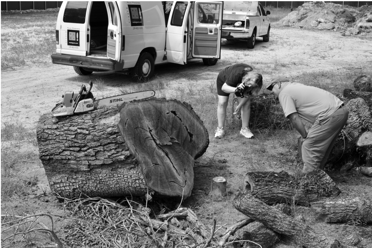
Remnants of the Old Lee County Courthouse “Hanging Tree”

Free Wood For Artists Giveaway 2011 from Lee County Commissioners